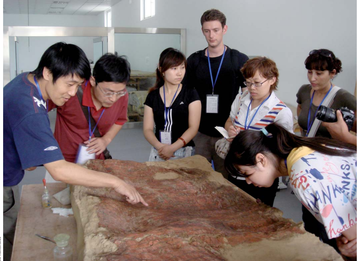
Chinese archaeological experts explaining the technique they had developed of preserving the fossilized traces of 2000 year old silk found in a tomb in Xi'an.

Cross cultural collaboration in the conservation of China's heritage in Xi'an