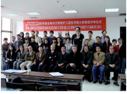
The opening ceremony of the Masters in the Conservation of Archaeological Materials in Xi'an Jiaotong University, Xi'an, China (March 2007). The author is in the center row, sixth from the right.