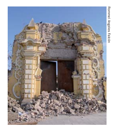
The ruined Church of the Company in Pisco

Collapsed mud walls at the pre-Inca and Inca sites of La Centinela and Uquira