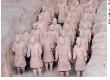
The Terracotta Warriors, discovered near Xi'an, guarding the tomb of China's first Emperor (Qin Shihuangdi).