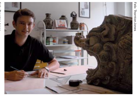
The author working in the laboratories at the Center for the Conservation & Restoration of Cultural Property, Xi'an.

classes were delivered, has a unique place in Chinese conservation as it was set up by Italy in the early 1990s along European lines. This represented the beginnings of a shift by the Chinese away from a tradition of craftsman/restorers towards a more scientific conservation ideal based on cooperative international projects, and is the embodiment of the direction that conservation in China is aspiring to take.