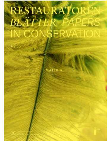
Restauratorenblätter-Papers in Conservation book cover.