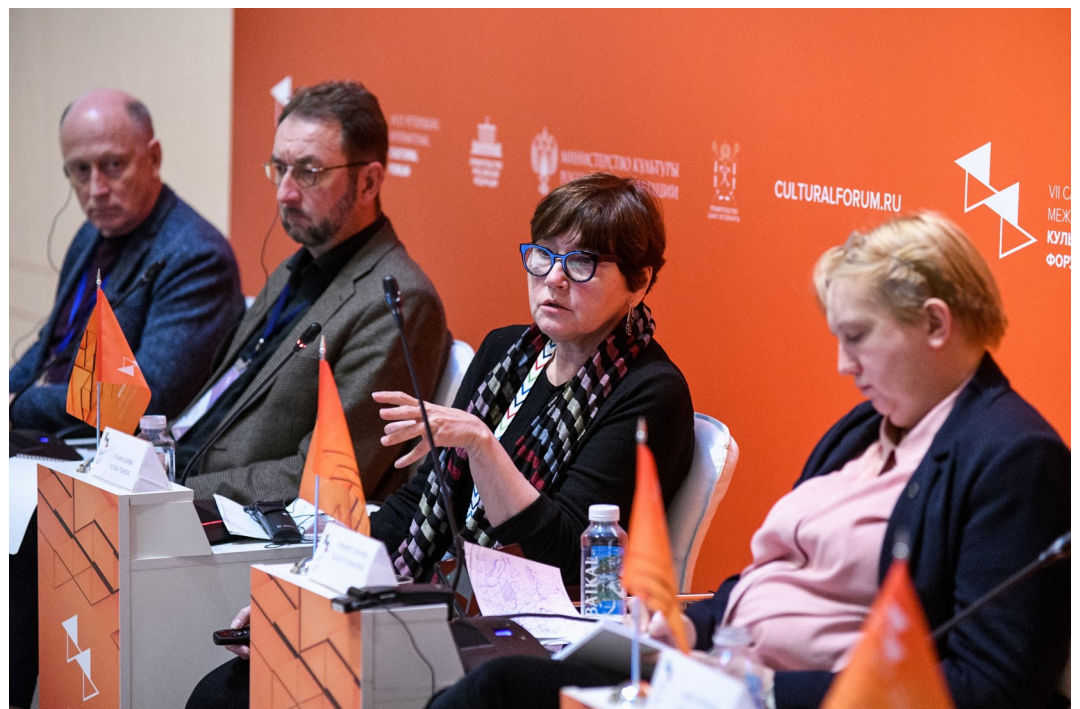
Speakers from the Cultural Heritage Preservation presentation “Saving Icon of the Avant-Garde: Survey of Melnikov House as Crucial Stage of its Preservation.” Photographer: Yevgeny Yegorov/TASS Photo. 2018 (original location: https://culturalforum.tassphoto.com/ ).

The program, with various venues throughout the city, was organized by the Government of the Russian Federation and the Ministry of Culture of the Russian Federation.