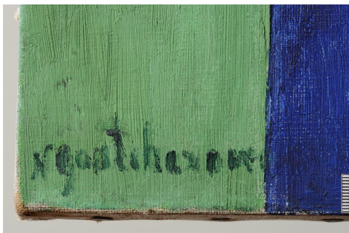
Detail of the signature, N. Goncharova, The Orange Seller , 1916, collection Museum Ludwig: Inv. Nr. ML 1484.

understanding of their work. Goncharova and Larionov allow for a particularly fascinating study of artists' practices. As an artist couple, their shared approaches influenced each other; the study provides insight into a close working relationship. As members of leading artists' groups across Russia and Europe, such as the 'Jack of Diamonds', 'Moscow Futurists' and 'Blue Rider', Goncharova and Larionov were also highly influential for 20 th -century modernism; thus, information collected on their materials and techniques also provides wide ranging implications for the study of their early 20 th -century contemporaries.